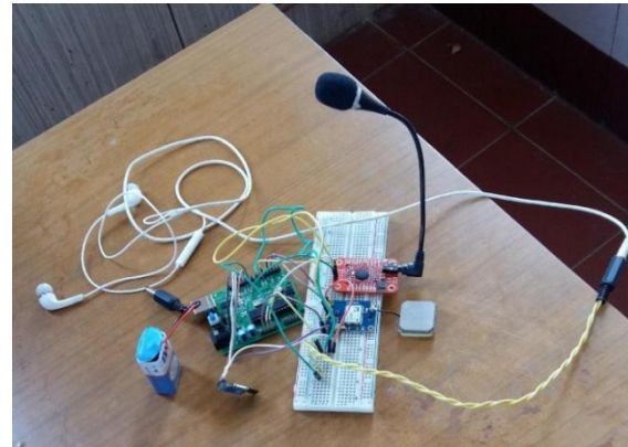
Fig. 6: Hardware implementation