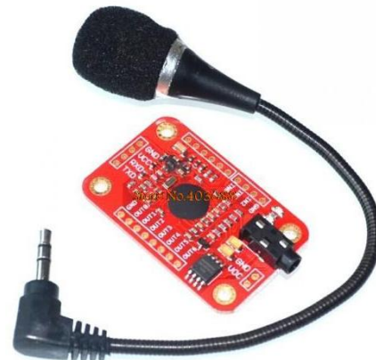
Fig. 4: Voice Recognition Module V3

The blind person gives destination's name as the input to the voice recognition module. The system compares the destination with the stored locations in the database. We have used Voice Recognition Module V3. Voice Recognition Module is a compact and easy-control speaking recognition board. This product is a speaker-dependent voice recognition module. It supports up to 80 voice commands in all. Max 7 voice commands could work at the same time. Any sound could be trained as command. Users need to train the module first before let it recognizing any voice command. This board has 2 controlling ways: Serial Port (full function), General Input Pins (part of function). General Output Pins on the board could generate several kinds of waves while corresponding voice command was recognized. Some of the parameters of V3 are listed below: