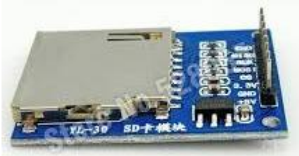
Fig. 5: SD Card module

It allows to read and write to the SD card using your arduino through programming. It is easily interfaced as a peripheral to your arduino sensor shield module. It can be used for SD Card more easily, such as for MP3 Player, MCU/ARM system control