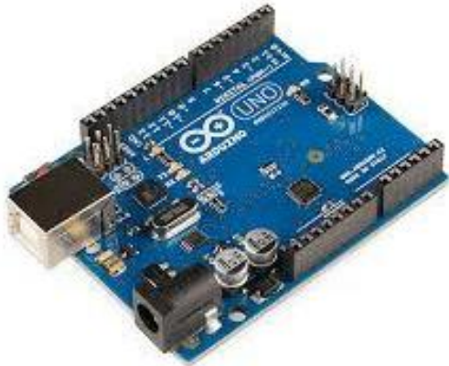
Fig. 2: Arduino

Arduino is an open-source computer hardware and software company, project and user community that designs and manufactures kits for building digital devices and interactive objects that can sense and control the physical world. An Arduino board consists of an Atmel 8-bit AVR microcontroller with complementary components that facilitate programming and incorporation into other circuits. The Arduino integrated development environment (IDE) is a cross-platform application written in Java, and derives from the IDE for the Processing programming language and the Wiring projects. It includes a code editor with features such as syntax highlighting, brace matching, and automatic indentation, and is also capable of compiling and uploading programs to the board with a single click. A program or code written for Arduino is called a sketch.